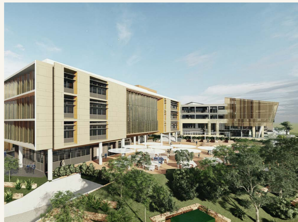
View of North East & East Façades

“Bringing this vision to life will create a place of collaboration, learning and wellbeing that is inherently connected to Country and respects the environment.”