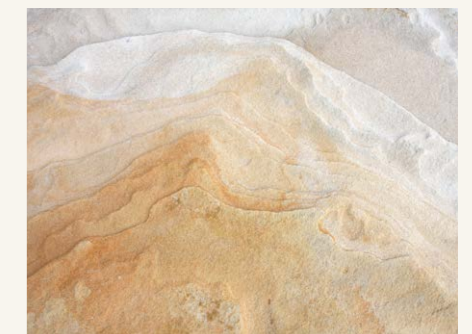
The architecture recalls the terrain of Cammeragal Country.

“I have been extremely blessed at Riverview to have been able to pursue my interests in science, including Physics, Mathematics and Quantum Computing. Given this, I am heartened by the potential of Wingaru to provide the dedicated space and resources for many other students to pursue their passions and extend themselves in the sciences.”