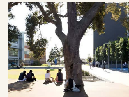
Flexible and adaptive outdoor spaces.