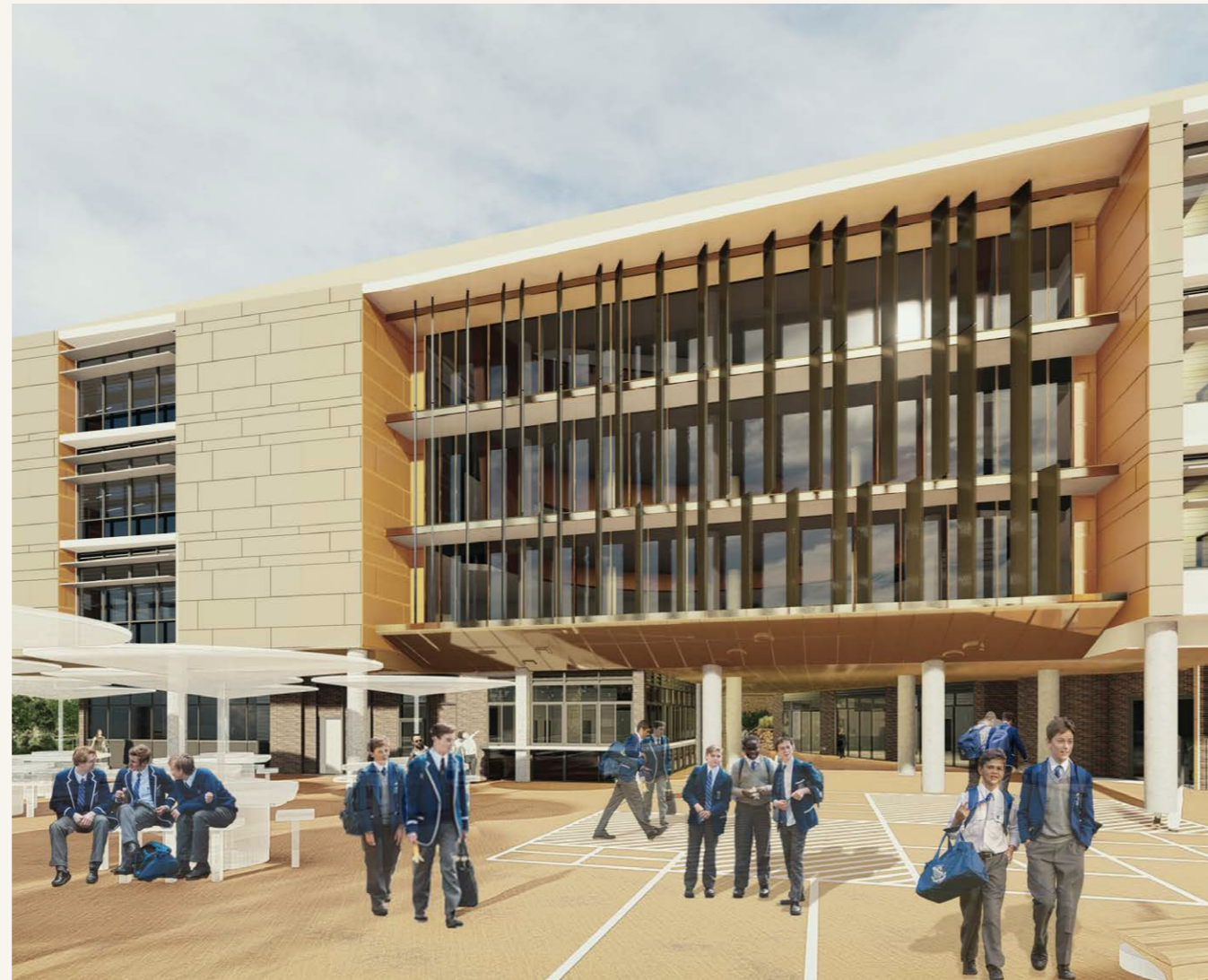
View of North East Façade

The new Wingaru science and technology building represents our commitment to contemporary learning practices, respect for cultural heritage and drive for future progress. Wingaru will provide our students with a place to grow, reason and reflect logically and critically. The College remains committed to inspiring and educating the next generation of thinkers to create a better world. Our graduates will be well-equipped with the necessary skills and grounded in the Jesuit values of discernment – to think, question, and act.